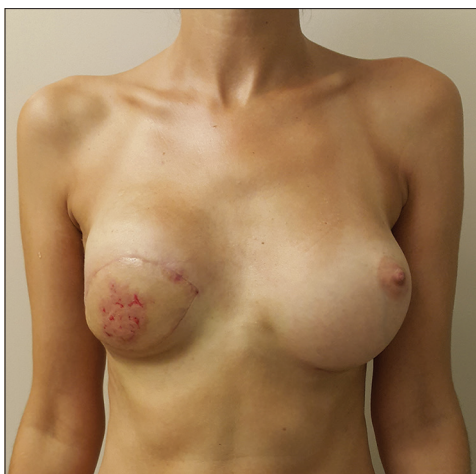
Figure 1: Erythematous rash with dendritic ulcers on the skin paddle of the latissimus dorsi flap

under the latissimus dorsi and pectoralis major muscles. The patient's postoperative course was uneventful. However, 2 months following the reconstruction, she developed a painful rash on the latissimus dorsi musculocutaneous flap. A physical examination revealed an erythematous rash with dendritic ulcers. As dendritic ulcers were present only on the skin paddle of the latissimus dorsi flap [Figure 1] but not spread along the right hemithorax and right side of the back [Figure 2], our preliminary diagnosis was a circulatory problem in the flap. A change in skin color would help confirm a blood circulation problem; however, 2 days later, no change was noted in the skin color of the flap. Thus, her skin lesions were evaluated by a dermatologist and diagnosed as a herpes zoster infection. The patient was treated with antiviral therapy and all skin lesions healed in 2 weeks without incident. On a routine follow-up visit 2 years after the reconstruction, we noted herpes zoster scars only on the skin of the latissimus dorsi flap [Figure 3].