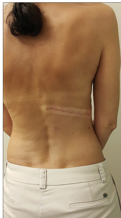
Figure 2: No herpes zoster eruption on the right hemithorax and right side of the back along with the distribution of the Th5 to Th6 dermatome

Spontaneous reinnervation of a reconstructed breast with autologous flaps is still controversial. Studies have reported that the quality of re-introduced sensory perception depended on the type and the sensory end organs in the transferred flap. [4] Similarly, Lehmann et al. [5] and Shridharani et al. [6] report the sensation of the transverse rectus abdominal flap was superior compared