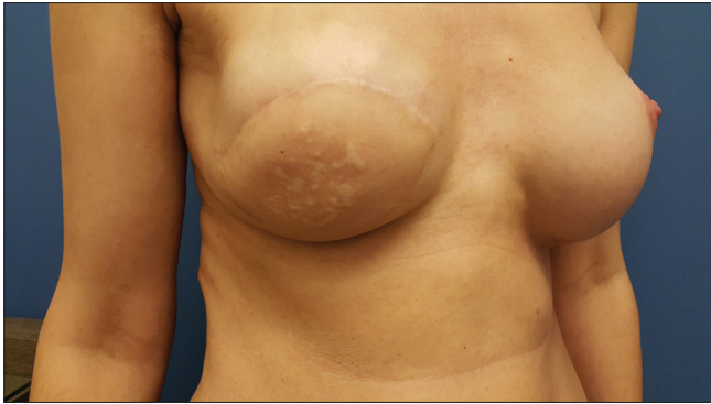
Figure 3: Herpes zoster scars on the skin of the latissimus dorsi flap

dorsi musculocutaneous flap and mastectomy bed would prevent reinnervation during such a brief period. However, in contrast to the previous study, the herpes zoster lesions were limited to the latissimus dorsi musculocutaneous flap, and there were no skin lesions around the mastectomy skin flap or the Th5 to Th6 dermatome of the right hemithorax.