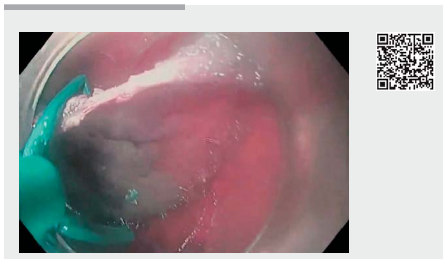
► Video 1 Procedure of peroral endoscopic myotomy for a Zenker's diverticulum using a scissors-type ESD knife.