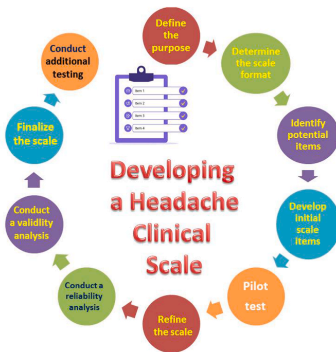
Fig. 1. Recommended steps for development of a clinical scale for headache disorders. A Step-by-Step Model for Developing a Clinical Scale for Headache Disorders: 1. Define the Purpose of the Scale: The first step is to clearly define the purpose of the clinical scale. What type of headache disorder is the scale intended to measure? Is it intended for clinical diagnosis, severity assessment, or treatment monitoring? 2. Determine the Scale Format: The next step is to determine the format of the scale. Will it be a self-report scale, an observer-rated scale, or a combination of both? Will it be a Likert scale, a visual analog scale, or another type of scale? 3. Identify Potential Items: Based on the purpose of the scale, identify potential items that could be included. This may involve reviewing the literature on headache disorders or consulting with experts in the field. 4. Develop Initial Scale Items: Based on the identified items, develop the initial set of scale items. It is important to ensure that the items are clear and unambiguous. 5. Pilot Test the Scale: Pilot test the scale on a small sample of patients with headache disorders. This will help identify any issues with the scale, such as unclear items or response options. 6. Refine the Scale: Based on the results of the pilot test, refine the scale items and response options. This may involve removing or modifying items or adding new items. 7. Conduct a Reliability Analysis: Test the reliability of the scale by analyzing the consistency of responses to the scale items. This may involve calculating Cronbach’s alpha or other measures of internal consistency. 8. Conduct a Validity Analysis: Test the validity of the scale by examining its ability to measure what it is intended to measure. This may involve comparing the scale scores to other measures of headache disorder severity or diagnosis. 9. Finalize the Scale: Based on the results of the reliability and validity analyses, finalize the scale. This may involve making further refinements or adjustments. 10. Conduct Additional Testing: Conduct further testing of the scale on larger and more diverse samples of patients with headache disorders to ensure that the scale is applicable to a wider range of individuals.

The process of creating clinical scales and PROMs typically involves several steps (Fig. 1). In clinical practice, a three-step approach is recommended for the development and validation of a scale: first, establish the conceptual framework based on the main concept; second, construct the item pool through reduction and scale development; and finally, perform field testing to determine the scale’s validity and reliability. Creating a scale idea based on a conceptual framework should begin with an in-depth literature review. Then, the authors need to construct semi-structured patient interviews and consult with an expert panel to determine the optimal items. After