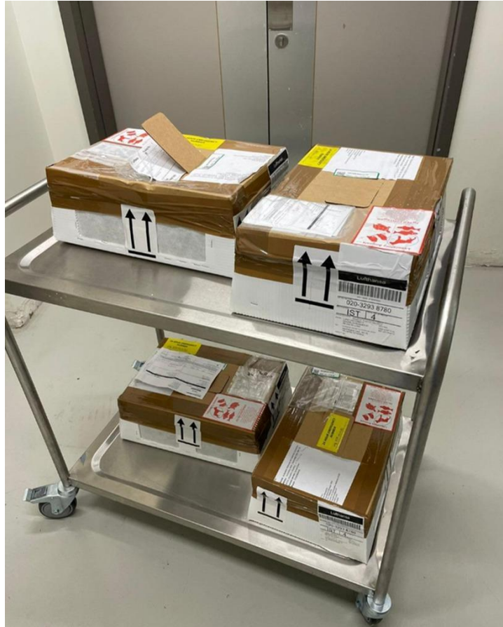
Figure 1: Photograph from the transfer of nestin-Cre and Sncaflox delta neo strains

Nestin-Cre and SNCAflox delta neo mice strains have been purchased from The Jackson Laboratory (JaxLab). Purchased mice were transferred to Acibadem Mehmet Ali Aydinlar University's (ACU) Transgenic Animal Research and Biosafety Laboratory (DEHAM) from JaxLab on 9 January 2023. Following a one-week quarantine period, each mouse was checked for their health status by Talat Taygun Turan, a member of the GEMSTONE Project.