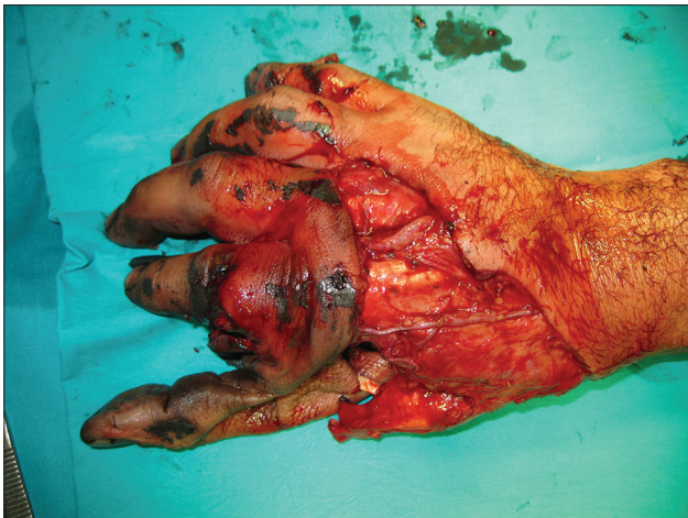
Figure 1: Preoperative - dorsal view of the hand and the thumb stump

Due to severe damage to the neurovascular structures, microsurgical treatment options are quite difficult in avulsion-type finger injuries. In the past, amputation, local pedicled flap, abdominal flaps, and many other treatment options have been proposed in these type injuries. [6,7] Functional and cosmetic results in all of these treatment options are inadequate. Therefore, in the treatment of such injuries, microsurgical treatment should be considered as a first choice, and in cases which microsurgery is not possible, other treatment options should be considered. [8]