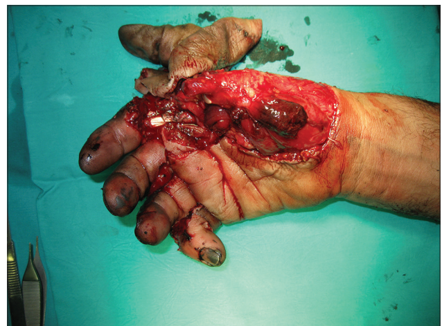
Figure 2: Preoperative - palmar view of the hand and the thumb stump