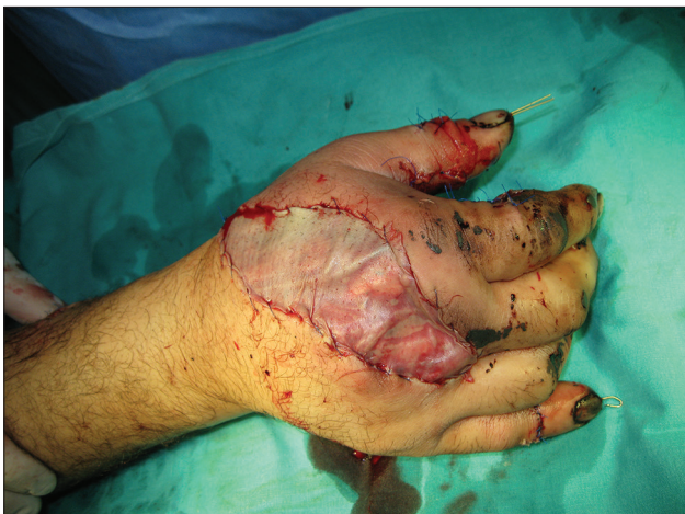
Figure 3: Immediate postoperative view of the hand