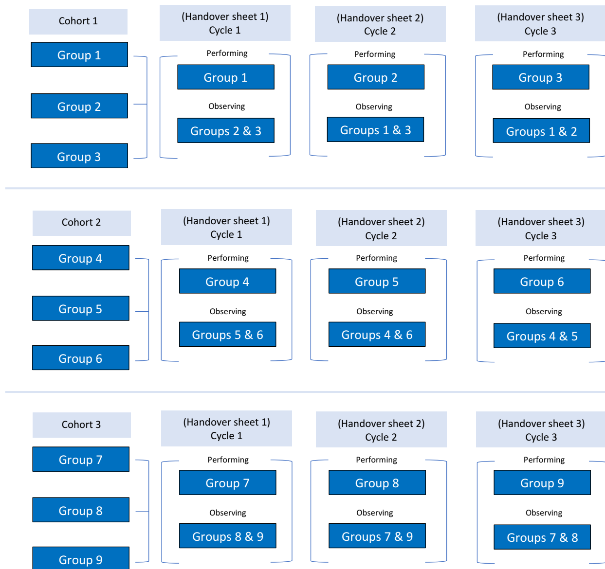
Figure 1 Study map.

The course participants were split in 9 groups of 4 or 5 people. We mixed students from different years of studies (experience) and educational background (diversity) to achieve equality (knowledge, clinical experience) across different groups and for it to be representative of an international healthcare service system such as the National Health Service (NHS) in the UK. For this study, we matched 3 groups in each cohort and ran 3 cycles of scenarios. Hence, we had 3 cohorts consisting of 3 groups and each cohort attended 3 cycles of scenarios. During each cycle, all teams performed once and were observed twice; this means 1 group was performing, and 2 groups were observing through 9 cameras in a special control room designed for this purpose (Figure 1).